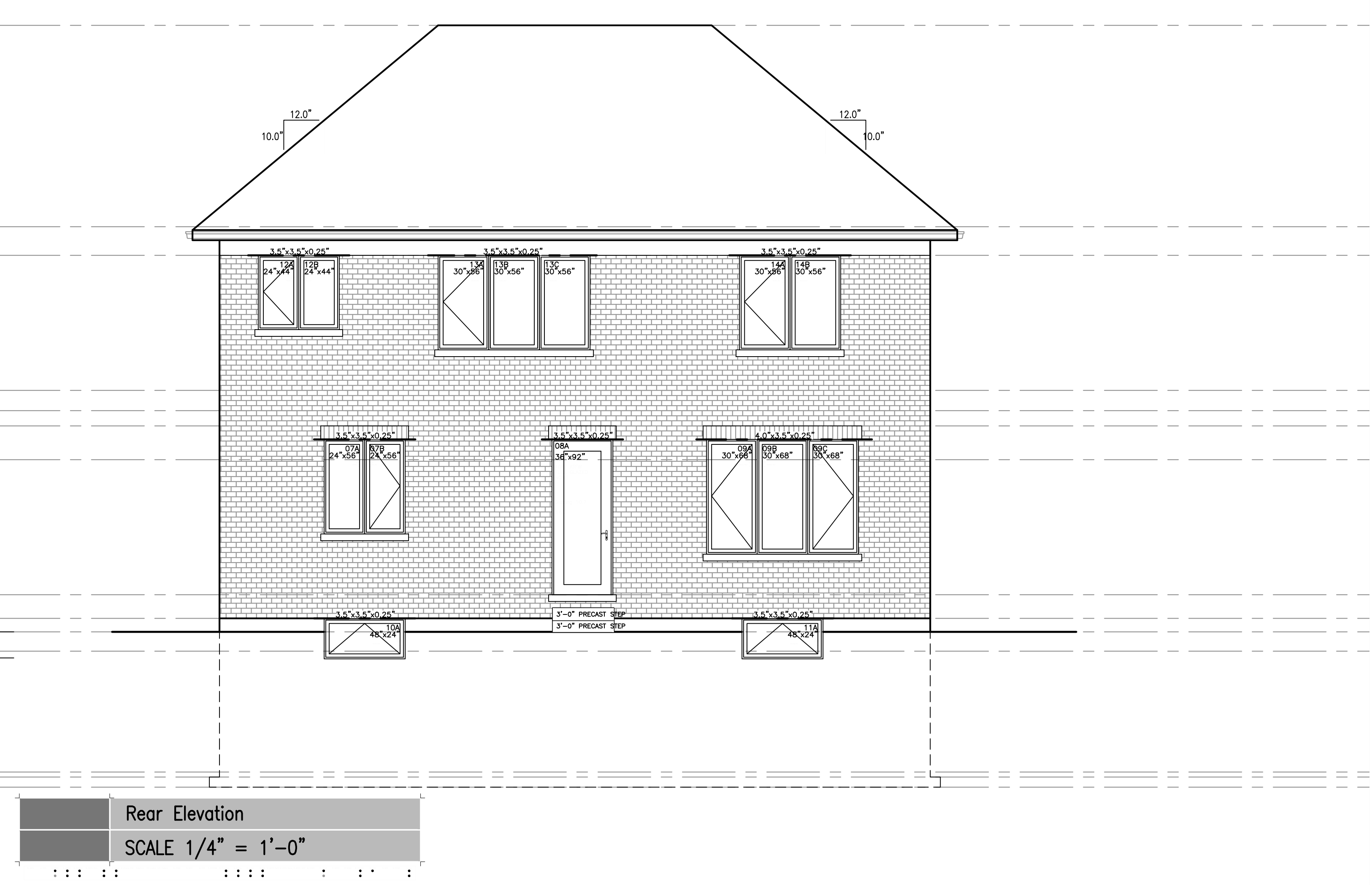
Rear Elevation SCALE 1/4" = 1'-0"